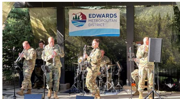
101st Army Hot Seven Jazz Band at the Band By the River.