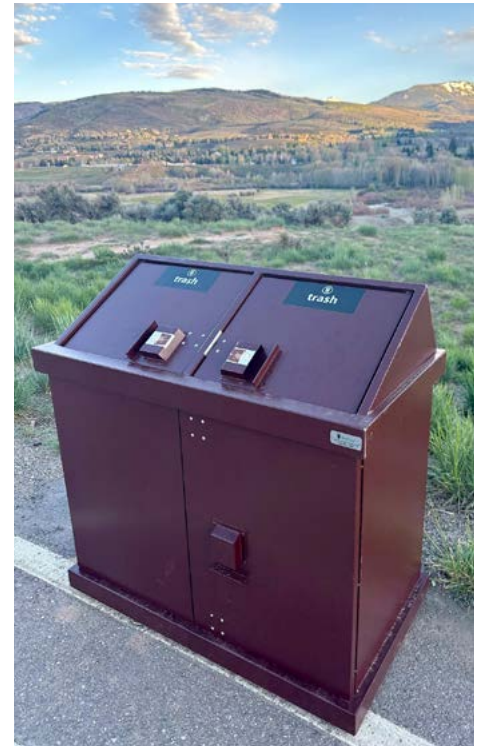
39 bear-proof trash bins installed throughout Edwards Metro District

As bear activity increases during warmer months, you’re encouraged to use wildlife-resistant trash containers and practice proper waste disposal to help protect local wildlife and ensure community safety.